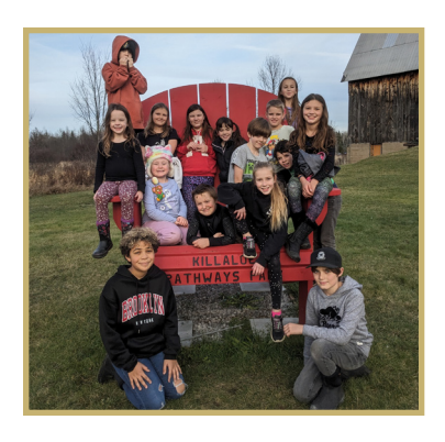
KPS Green Earth Club

The Killaloe Public School Green Earth Club is a group of committed students who lead and promote environmental stewardship at the school and in the community. The club has been together since 2018 and has completed numerous projects and ongoing green actions.