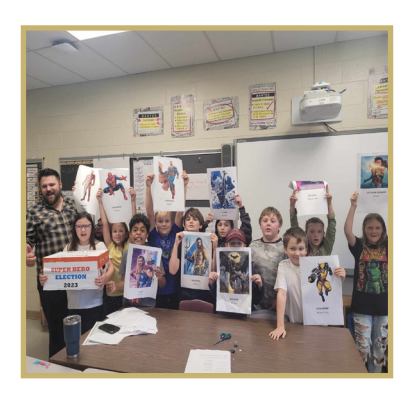
Local Government Week

Another focus for the year is to create an eco-code, which is our school's mission statement to environmental learning and climate action. Other initiatives that the club supports include diverting textile waste, the 3 R's, planting trees and butterfly gardens, waste free lunches, community clean-ups, energy conservation, and just having fun being green!